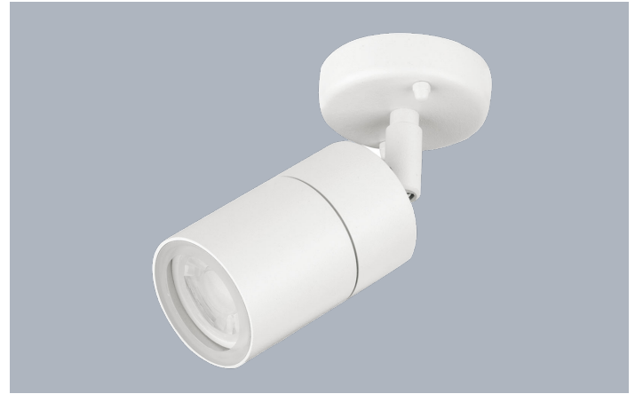
WallE™ GU10 IP44 Adjustable Wall Light