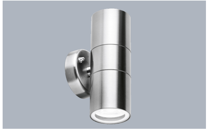
WallE™ PRO GU10 IP65 Fixed Up/Down Wall Light