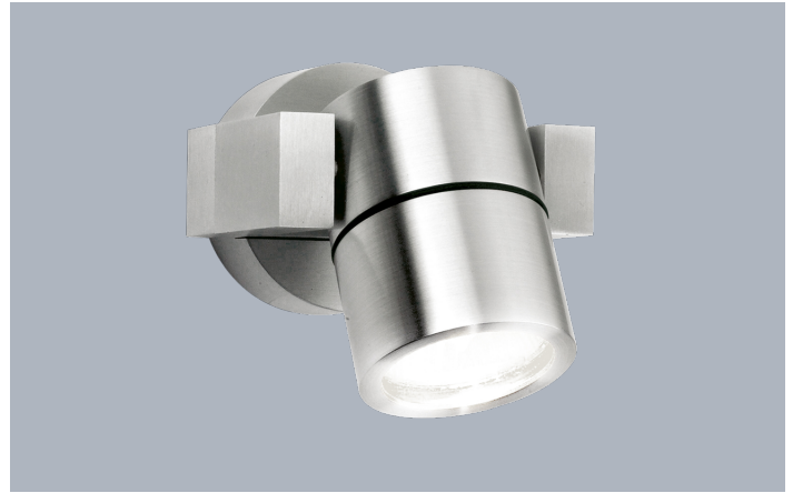
240 GU10 IP54