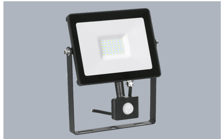
QuaZarPIR™ 30W Adjustable IP65 Driverless LED Floodlight