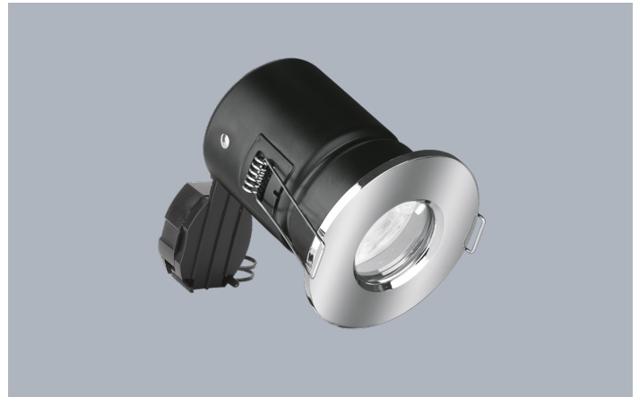
EFD™ GU10 IP65 Aluminium Fire Rated Downlight