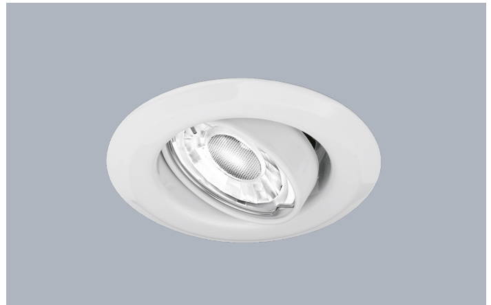
EDLM™ GU10 Pressed Steel Adjustable Downlight