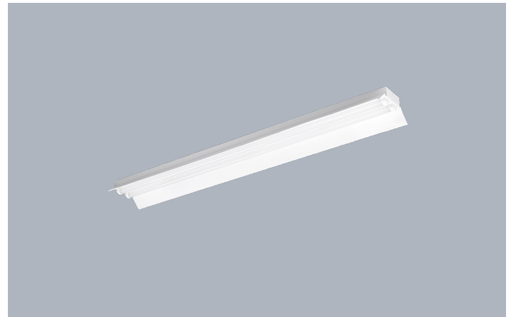
EcoT8™ 1500mm 44W IP20 Twin Winged Open T8 LED Batten