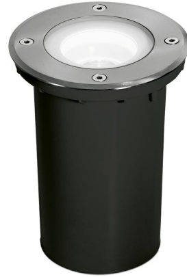
10W IP67 Walkover