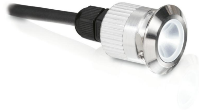
3W IP68 Marker Light