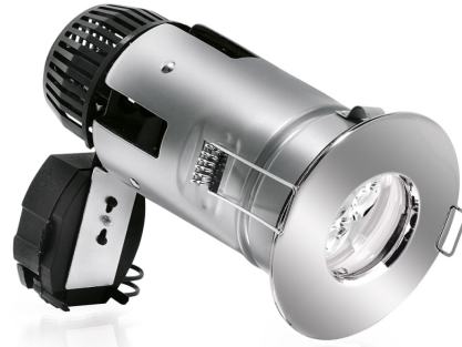
Universal™ IP65 Fixed Fire Rated Downlight