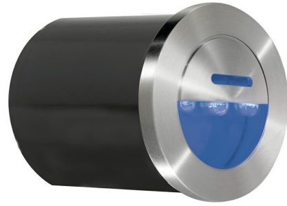
1W IP65 Eyelid Wall Light