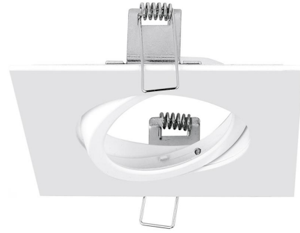
LED ajustable único múltiple