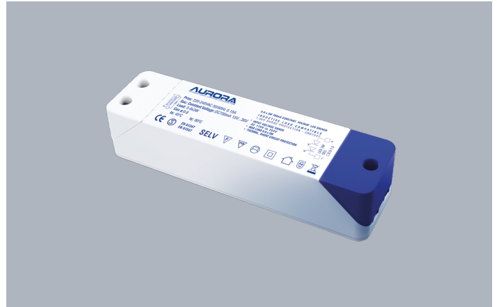
25W 24V Konstansspannungs-Treiber Nicht Dimmbar