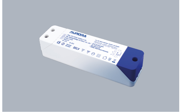
LED 12 1-16 IP68