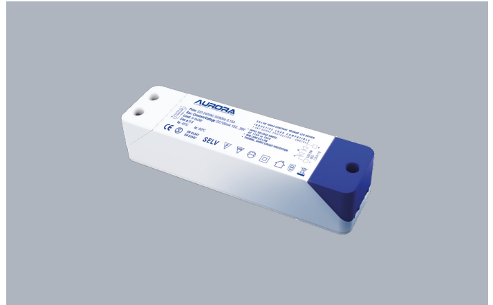
Driver de tensión constante no regulable para LED: 12 VCC, 10 W