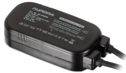
50- 105 / IP68