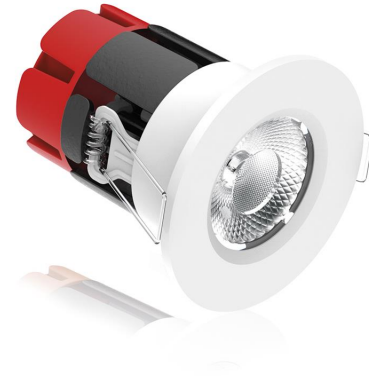
m7™ 6W IP65 Fixed Non-Dimmable Fire Rated Downlight