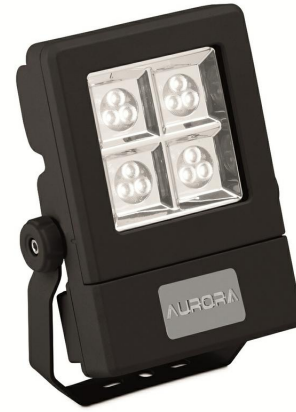
25W IP65 Adjustable 58° Floodlight