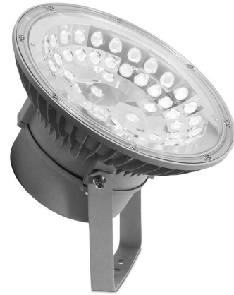
100W IP65 Floodlight