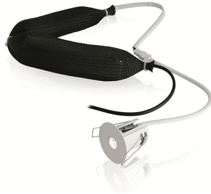
Fuente de alimentación de emergencia para módulos LED no mantenida: 240 V, 2 W, 3 horas de autonomía