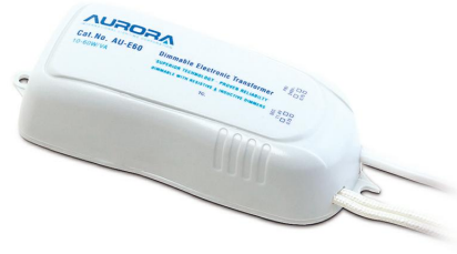
Premium 10-60 /