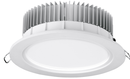
dSeries™ 18W IP44 Dimmable Downlight