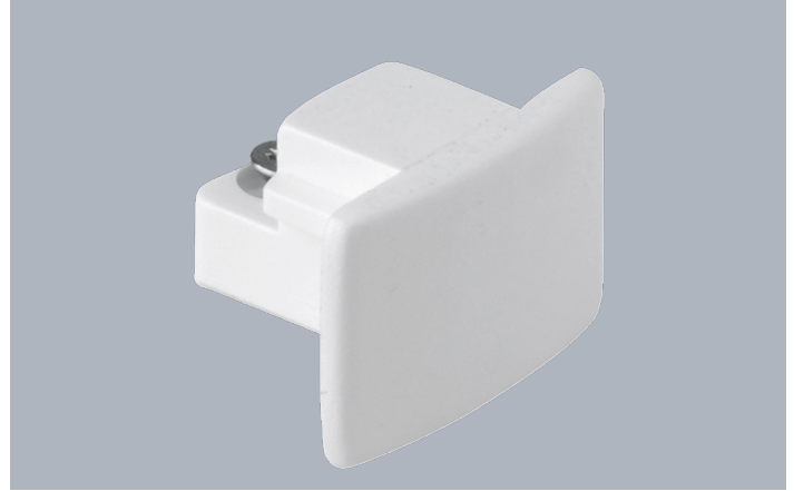
250V Global Dead End Connector Single Circuit Track